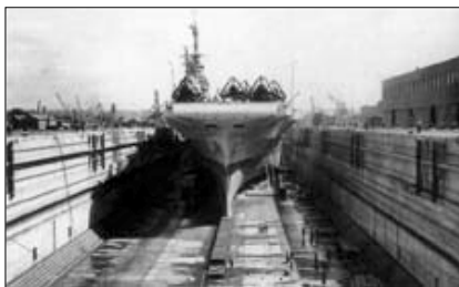
HMS Illustrious in Captain Cook Dock 1945

During World War II the facilities for the servicing and maintenance of naval ships were greatly expanded. The Captain Cook Graving Dock, built during the war and first used in 1945, joined the island to the mainland. The facilities at Garden island are now shared between the Royal Australian Navy and Australian Defence Industries Limited which undertakes both naval and civilian work there.