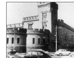
Tram Depot, Bannelong Point

In 1819 Governor Macquarie built on the island a substantial fort designed by Francis Greenway and gave it his name. The island was joined to the mainland by a causeway and became Bannelong Point. The fort was demolished in 1902 and a tram depot erected in its place was in use until the early 1950s. In 1954 Bannelong Point was selected as the site for the Sydney Opera House, opened in 1973.