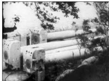
Gun barrels on Clark Island, World War II

The island is named after a lieutenant of the First Fleet who established a vegetable garden there. Since 1879 it has been a public recreation reserve, except during World War II. At that time the British navy stored on the island spare barrels for the 14-inch guns on its four battleships stationed in the Pacific. After the war, when battleships became obsolete, the barrels each weighing around 100 tons were taken to Cockatoo Island and cut up for scrap.