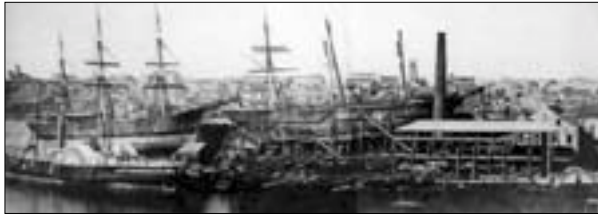
Australasian Steam Navigation Company Shipyard, Darling Island 1860

The islands of Sydney Harbour have a part in the industrial and engineering development of the city. In two ferry trips, on to the east from Circular Quay and the other to the west, you can view most of the islands from the harbour and appreciate some of their history.