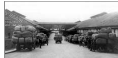
Wool delivery to Darling Island

The New South Wales Government purchased the island in 1899 and developed the area for wharves and railway yards. The two brick buildings on the edge of Darling Island are the Royal Edward Victualling Yard, built on timber piles over the water. They were opened in 1907 for use as stores by the Royal Navy and in 1994 were converted to offices.