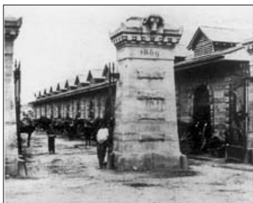
Glebe Island Abattoirs