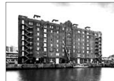
Royal Edward Victualling Yard