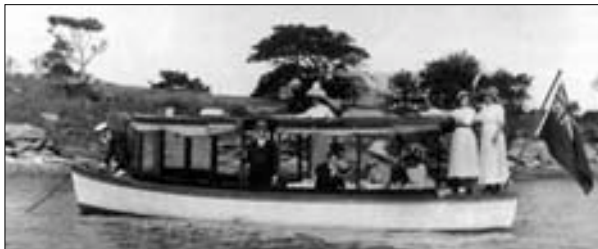
Picnic, Shark Island 1912