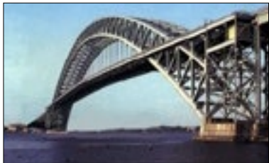
Bayonne Bridge, New York

The distance between the base hinges of Sydney Harbour is 503 m. But it was never the longest arch span because the 1931 Bayonne Bridge over the Hudson River between New York and New Jersey is 60 cm longer. The world's longest span for an arch bridge is 518 m for the New River Gorge Bridge in West Virginia, USA, opened in 1977.