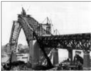
The part completed arches with anchor cables