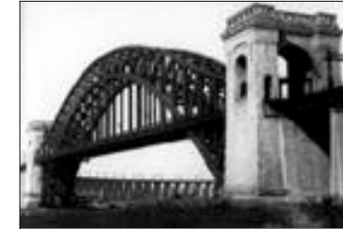
Hell Gate Bridge, New York

Bradfield cabled instructions from England to postpone closing of tenders, worked on the specifications for an arch bridge on his sea trip home, and included it as an option in a revised call for tenders. The Minister for Works signed a contract to build the bridge with the British firm Dorman Long on 24 March 1924. Almost eight years later the bridge was opened.